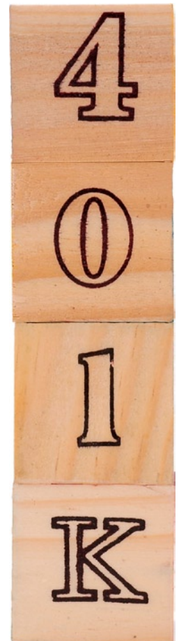
401(k)—continued on Page 3

tribution for each non-highly compensated employee (NHCE) who elects to contribute to the plan. The basic matching formula is 100 percent for at least the first three percent of employee compensation and 50 percent on the employee's own contributions above three percent, but